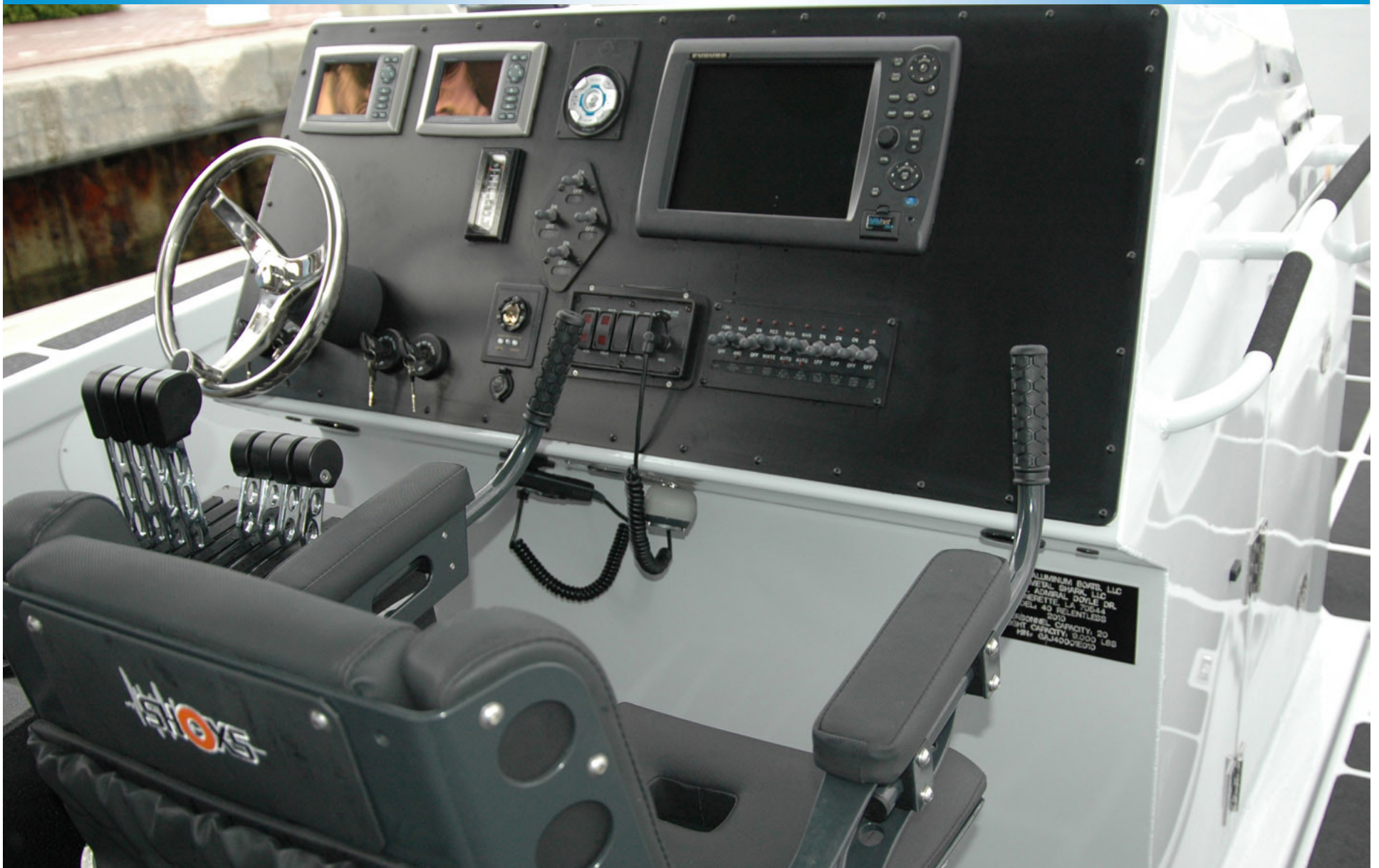
Spacious helm puts all controls within easy reach and offers ample room for navigation electronics.