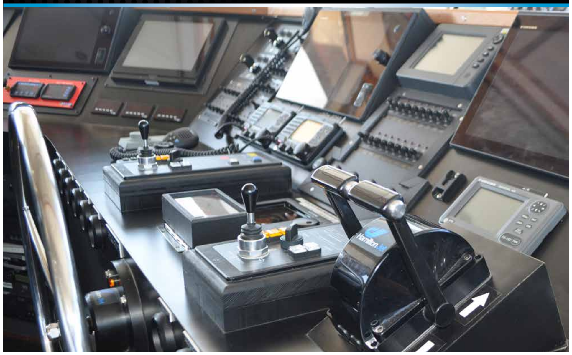
Helm Detail: The Metal 75 Endurance DSV's spacious helm can easily accommodate a full range of controls, instrumentation, navigation electronics, and specialized equipment.