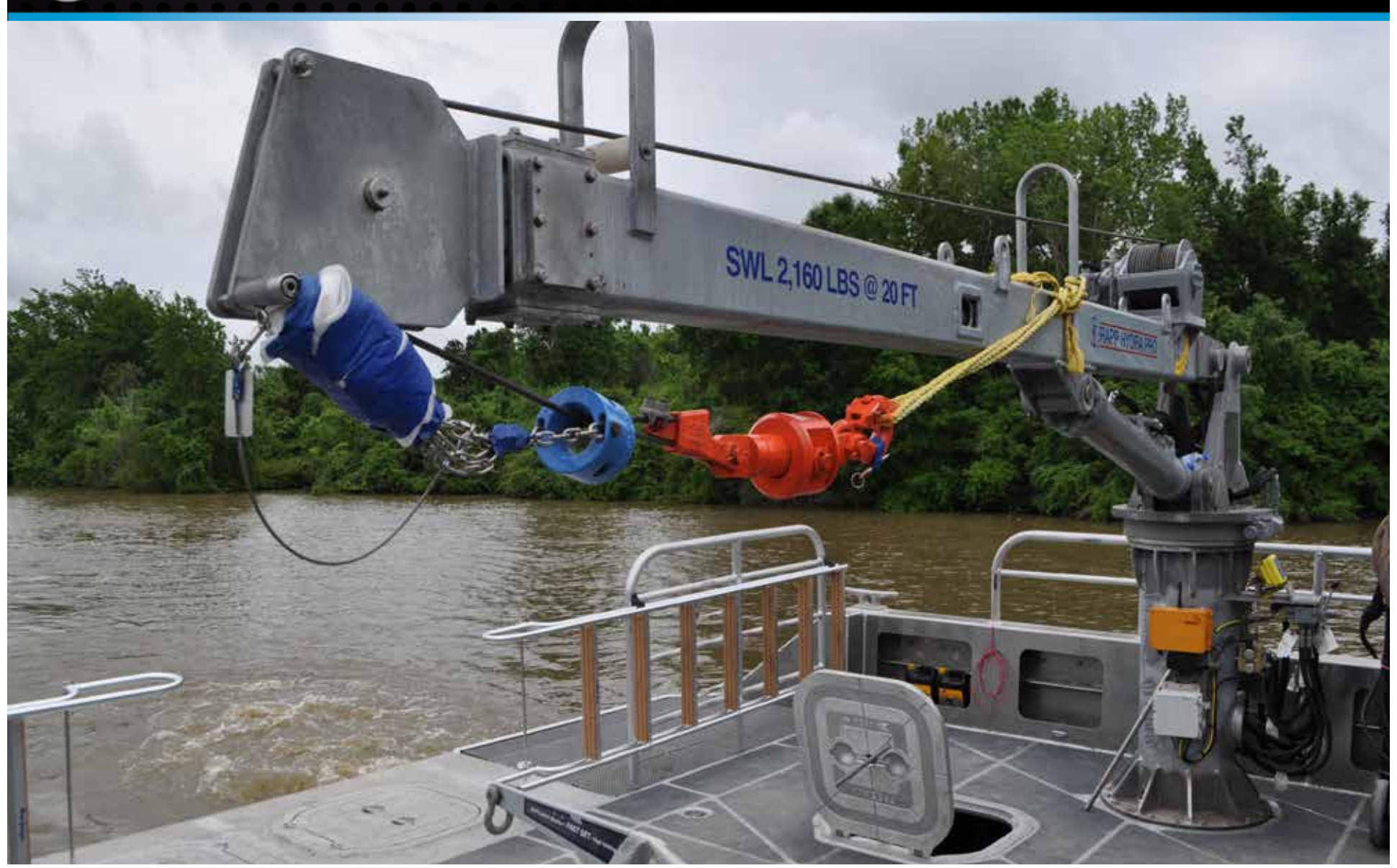
Diveboat Capability: The 75 Endurance DSV may be equipped with a large aft deck crane, such as the 2,160lb. capacity unit shown here.