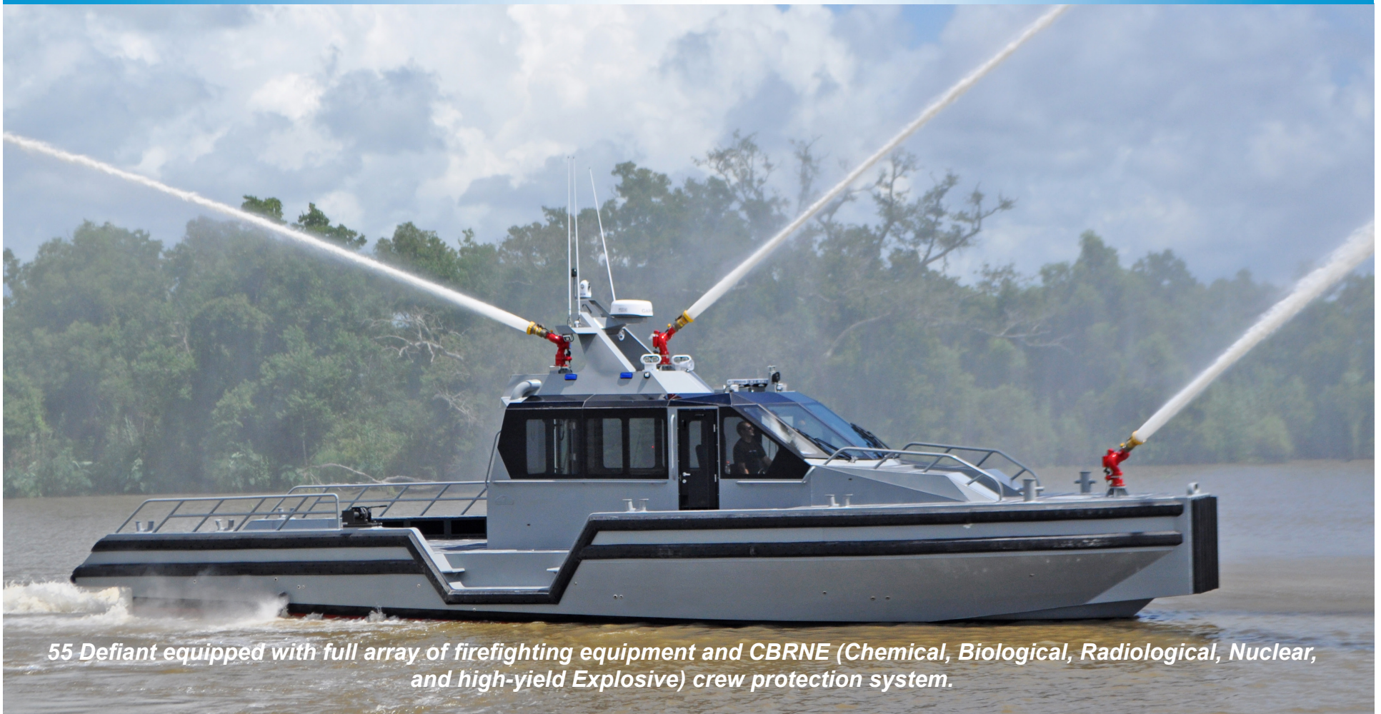
55 Defiant equipped with full array of firefighting equipment and CBRNE (Chemical, Biological, Radiological, Nuclear, and high-yield Explosive) crew protection system.

Fire Rescue: The 55 Defiant shown above employs the same proven hull design as the 64 Defiant and serves as an example of a vessel equipped for fire rescue and port security. To meet the customer's fire fighting requirements, Metal Shark employed twin Darley fire pumps driven by PTO from the main engines. Water is pumped to an oversized main where it is distributed via electronic valves to three RF-controlled monitors. In this configuration, the 55 Defiant delivers water flow of up to 10,000 gallons per minute. Two 5" hydrant outlet locations, an additional 2.5" hydrant outlet, and a 300-gallon foam reservoir provide maximum flexibility across the widest possible range of firefighting scenarios.