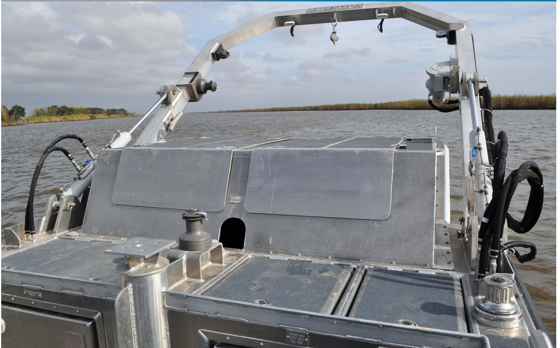
Transom view showing raised aft deck overhang, hydraulic-actuated a-frame, and gun mount.