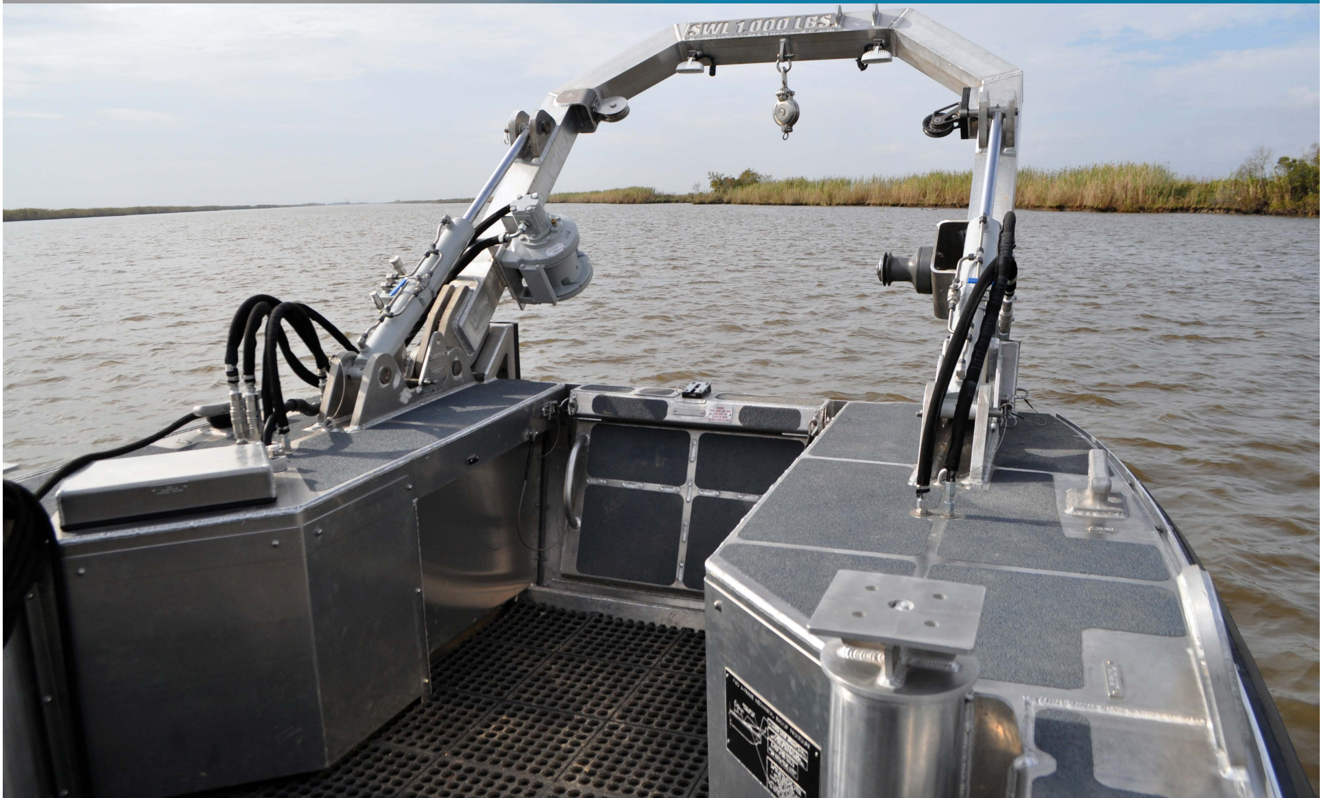
Interior cockpit view showing optional forward hydraulic-actuated A-frame and bow loading door, shock-reducing cockpit flooring, and gun mount.