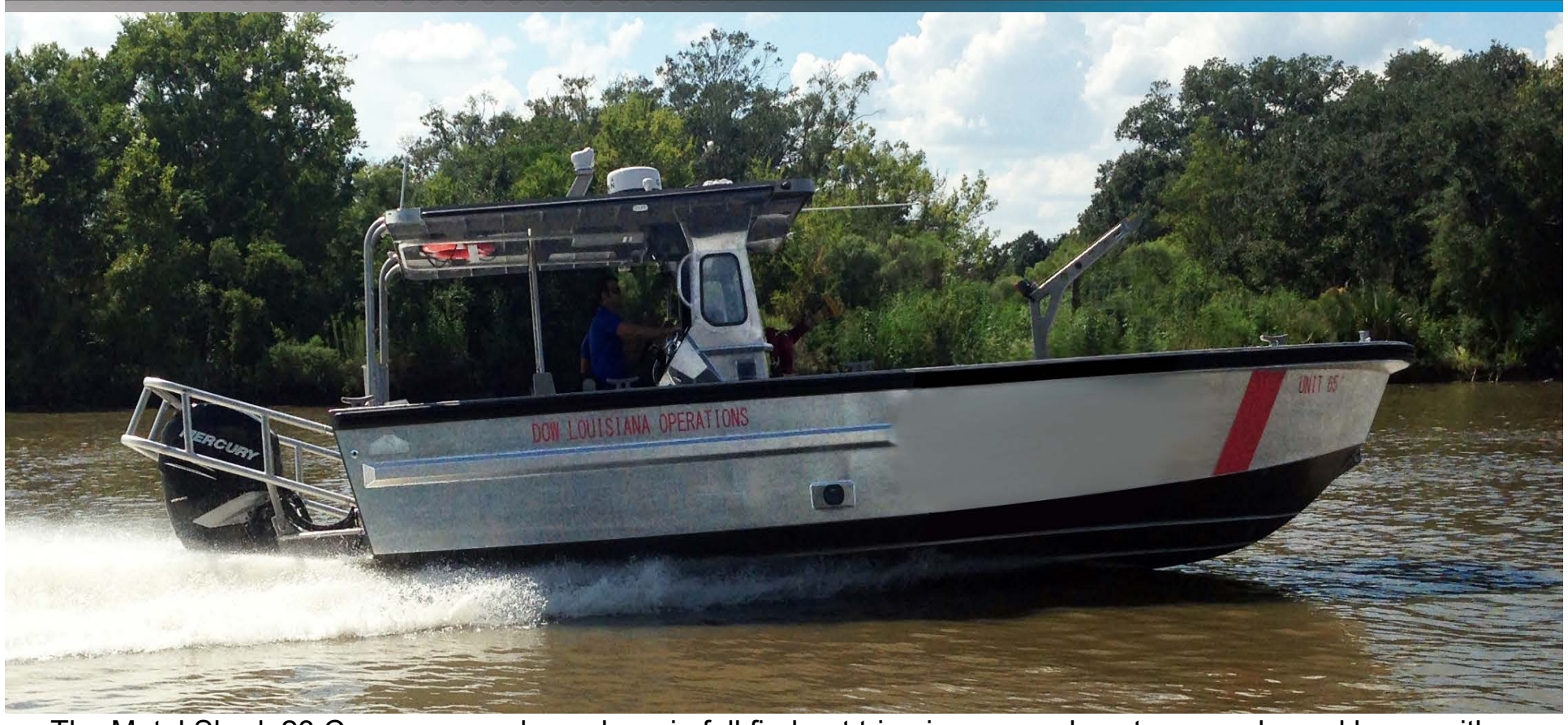
The Metal Shark 28 Courageous, shown here in full fireboat trim, is a rugged center console workhorse with a roomy cockpit, 20,000 lb. towing capacity, and a wide array of available configurations.