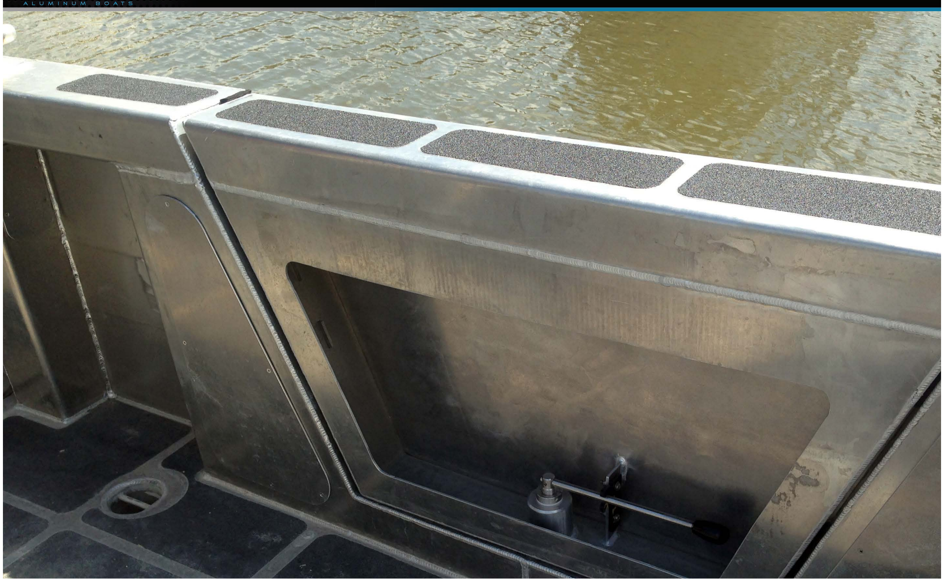
Available Dive Door: This large, removable door greatly facilitates water entry, especially considering the vessel's ample forward freeboard. The door latches securely in place when not in use.